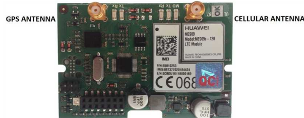
Image 1.1 CM-4G-GPS module

CM-4G-GPS plug-in module is a GSM/WCDMA/LTE cellular modem in combination with a GPS receiver. The cellular modem can work in two modes of operation based on the settings in the setpoint Mode.